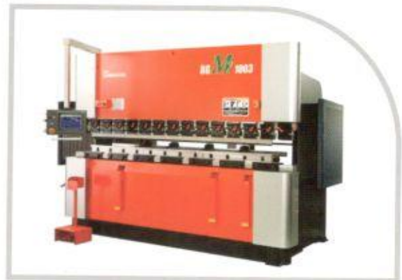
AMADA CNC Press Break RG1003