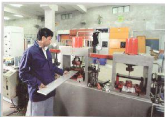
Hydraulic Bus Bar Bending, Punching & Cutting