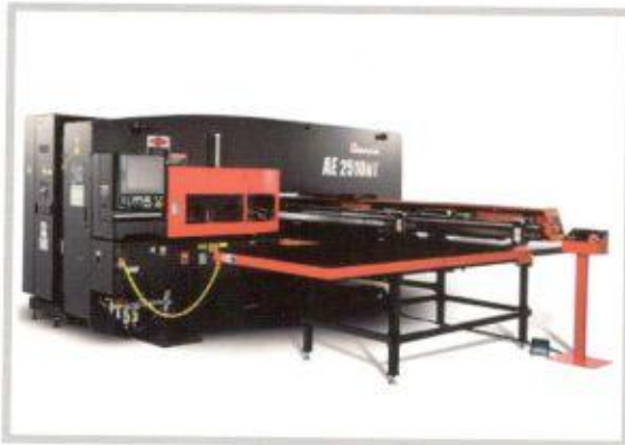
AMADA AE255 Turret Punch