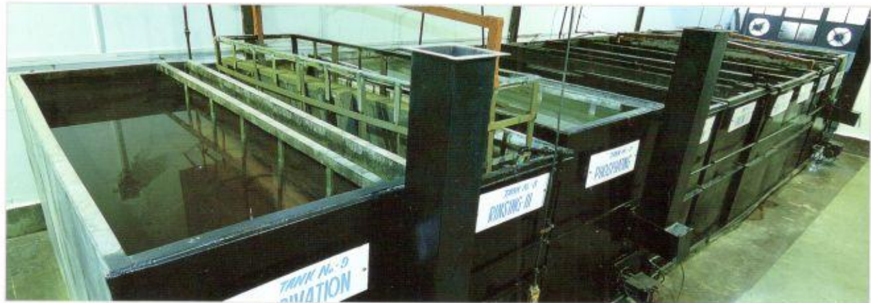
9 Tank Pre-Treatment Line

Wunder has inhouse state-of-the-art 9 tank pre-treatment plant followed by conveyerised powder coating plant for best quality metal treatment and finished surface.